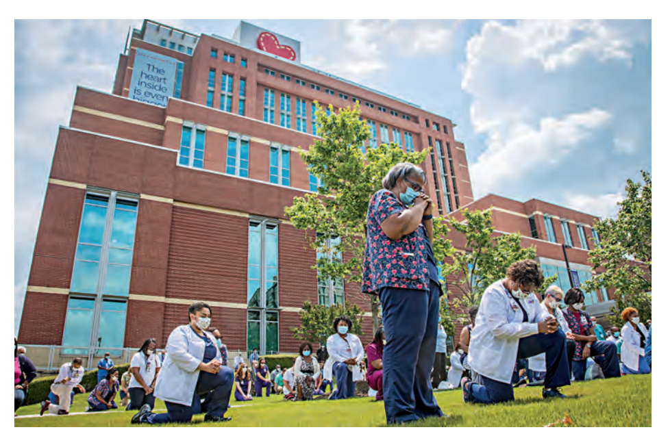
In June 2020, Le Bonheur providers and staff gathered in front of the hospital as part of the White Coats for Black Lives event. This was a turning point for hospital leaders leading to the formation of the Diversity, Equity and Inclusion Steering Committee.

"The whole time I felt that there was something about the situation (the mom) wasn't telling me. When I told her that the